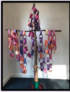
Lent Tent Prayers

This half term the Y6 Chaplaincy Team has been working hard to provide a special time of lunchtime prayer and reflection in the Lent Tent. Children from all year groups took the opportunity to pray quietly with their friends, to write prayer intentions and to pray the Rosary for peace. A wonderful example of faith in action.